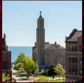
Loyola's Lake Shore Campus

Then, transition to Chicago with your group of friends to finish your degree. As one of the world's largest Jesuit, Catholic universities, we draw our strength from a diverse student body representing 82 countries. In other words, our University is full of students just like you.