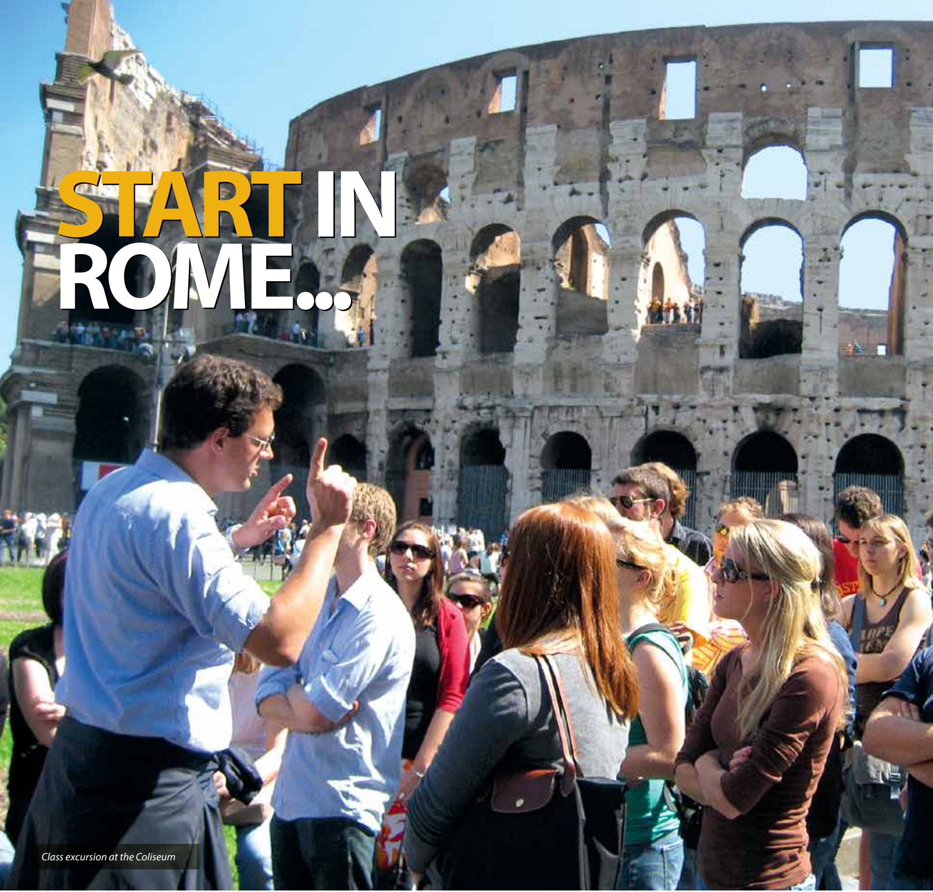
Class excursion at the Coliseum