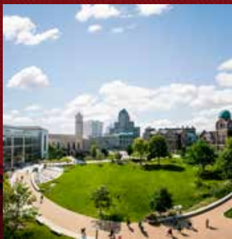
Loyola's Lake Shore Campus