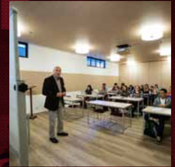
Classroom at John Felice Rome Center

During your first year, much of your focus will be on Loyola's Core Curriculum, which will help you build a strong liberal arts foundation infused with a commitment to responsible leadership. From there, you can explore the 80-plus majors available at Loyola.