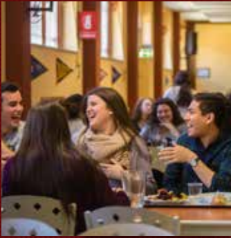
Dining inside John Felice Rome Center

At Loyola's John Felice Rome Center (JFRC), you'll join 200 students from Europe and the U.S. This diverse community gathers for traditional Italian meals, cookouts, tours of the Eternal City's famous monuments, nights out at the opera, talent shows, and weekly student-faculty football (soccer) matches. Students also participate in discussions on faith, social justice, and humanitarian service with a host of dignitaries who regularly visit campus.