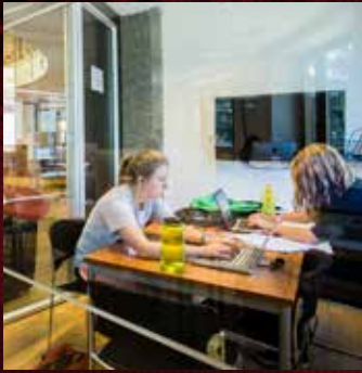
Study space inside the Commons

As part of an exciting initiative, Insieme per il Futuro (Together for the Future), the JFRC is being infused with new and renovated facilities. The new Information Commons at the JFRC is one of the most technologically advanced libraries in Rome and houses one of the largest collection of English language books in the city. Solar panels have been installed to help reduce our energy usage by 20 percent. It's all part of ongoing investment in you.