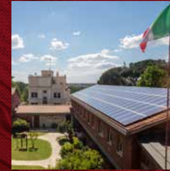
Loyola's John Felice Rome Center

Distinguish yourself as one of the select number of students to attend Loyola University Chicago's Rome Start Program. Join us at the John Felice Rome Center on the Monte Mario hill in Rome, Italy for the first year of college.