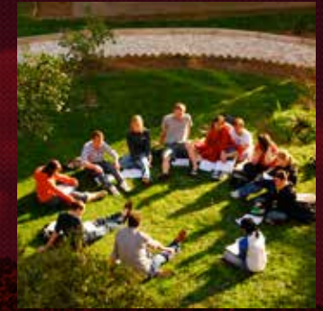
The Courtyard at John Felice Rome Center

We want you to feel right at home. And at the JFRC, you'll have all the necessary support to ensure a safe and successful experience. The campus spans five acres in the upper Balduina district of Monte Mario, Rome's highest hill.